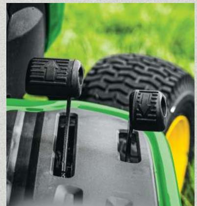
Side-by-side pedals. Easily change from forward to reverse with two-pedal foot control available on all 100 Series Lawn Tractors.