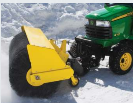
Rotary Broom. Sweep away all four seasons.