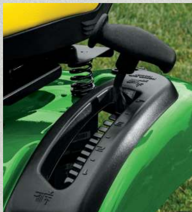
The convenient mower deck lift lever. ¼-in. (0.64-cm) height-of-cut increment adjustment is as precise as ever.