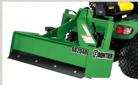
Box Blade. Shown with optional iMatch™ Quick-Hitch.