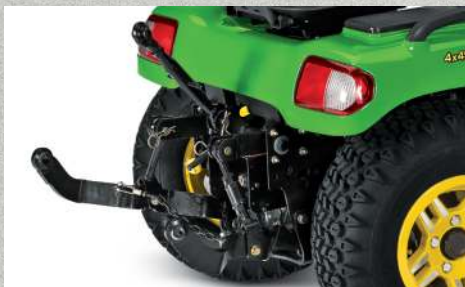
Optional Cat 0 or Cat 13-point hitch. It's the first step to tilling, cultivating and blading.