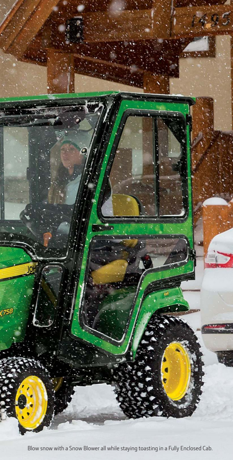
Blow snow with a Snow Blower all while staying toasting in a Fully Enclosed Cab.