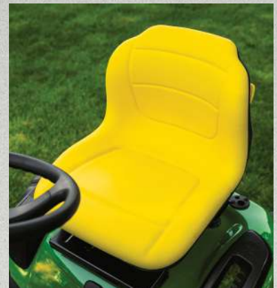
15-in lumbar seat. (available on S160, S170, S180).