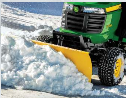
Front Blade. Clear the way and keep it clear.

Keep your John Deere Riding Lawn Tractor busy all year—even when your lawn is covered in snow. Our incredible spectrum of attachments can practically transform your mower in a different machine. Snow blowing, tilling, spreading. If you've got the task, we've got the attachment.