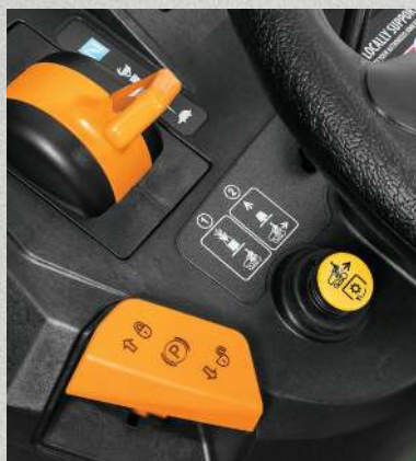
Electric PTO. Available on some models, provides instant engagement of mower blades. (available on all models from S130 and above).