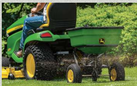
Spreader. Pull-type spin spreader available in 125lb (57 kg) or 175lb (80kg).