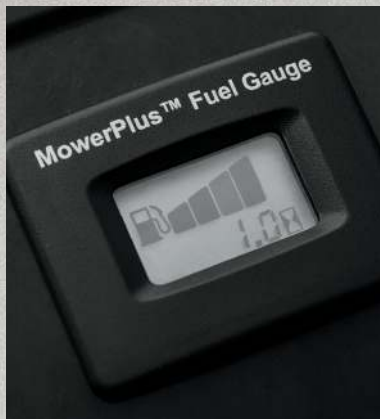
Easy read fuel gauge. (available on S120, S130, S160, S170 and S180).

BUMPER-TO-BUMPER 2-YEAR /120-HOUR WARRANTY**