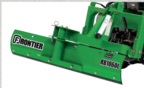
Rear Blade. Shown with optional iMatch™ Quick-Hitch.