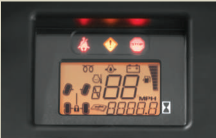
Easy-to-read dash panel lets you quickly scan your speed, gear position, and now, fuel level.

*The engine horsepower and torque information are provided by the engine manufacturer to be used for comparison purposes only. Actual operating horsepower and torque will be less. Refer to the engine manufacturer's web site for additional information.