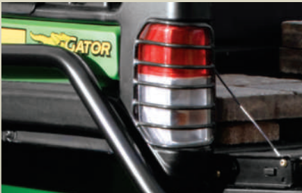
Tailgate lights increase visibility for backing in dusk or low-light conditions. Shown here with optional Tail Light Protectors.